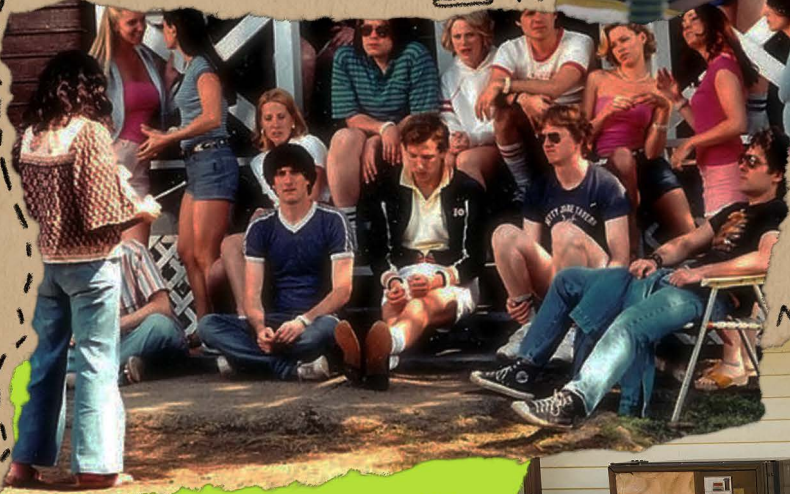
WET HOT AMERICAN SUMMER